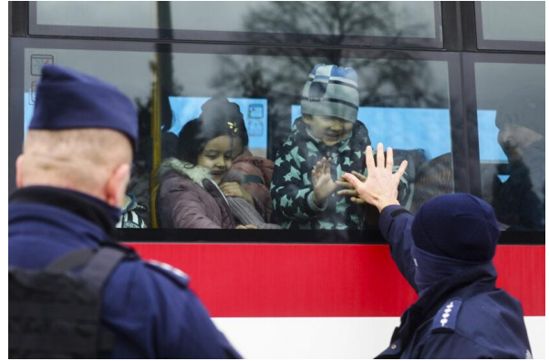
Separation of Families

One of the influential people in each individual's life is their family. Family provides unconditional love that is hard to be replaced by others. Many families had to separate through the Russia-Ukraine War when their country called up for reservists. Millions of young men had to fight in a war, although they might be unable to return to their families. In addition, parents of different nationalities had to separate for a while due to the war. The separation of families made Russians and Ukrainians physically and mentally suffer from the war.