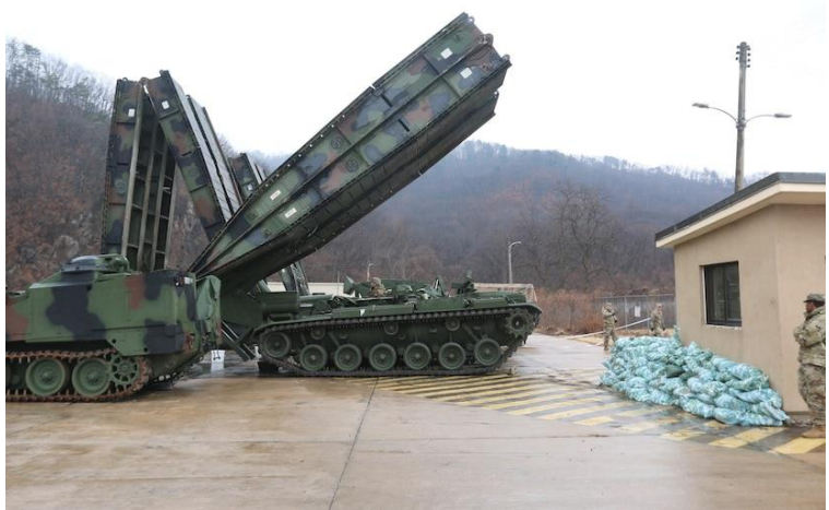
Army combat engineers train on the operation of the M60 Armored Vehicle

Meanwhile, Zelenskyy visited the White House and received two billion dollars in new military assistance for Ukraine. Then, in 2023, when US President Joe Biden visited Kyiv, he further supported Ukraine with five hundred million dollars in additional military aid. The support was for Ukraine's defense needs as well as for the world's peace and security. It is an action to find