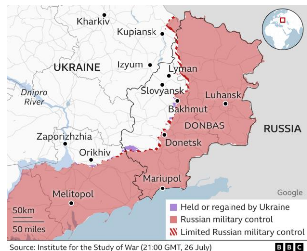
Tracking the War with Russia

The people in Ukraine and Russia still live under severe tension, where drones and missiles have already destroyed many essential infrastructures, and ceaseless casualties are reported. The estimated cost of damage to Ukraine's infrastructure is 63 billion dollars, including the attack on the water system, according to the Kyiv School of Economics. According to United Nations (UN) estimates, the casualties reached 1100 civilian deaths due to indiscriminate attacks. With that being said, Ukrainian refugees and Russian reservists suffer from the life-threatening war.