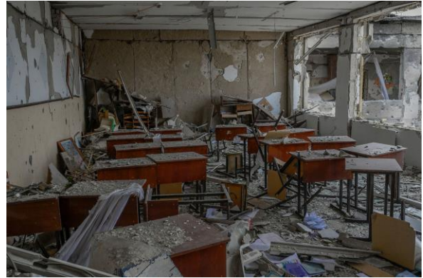
Destroyed Classroom in Ukraine due to the war

Education is necessary for humans to sustain their lives in society. It is an undeniable fact that the right to be educated cannot be undermined, although children are currently suffering from the war. To protect the right to learn for Ukrainian or Russian students, those who were forcibly displaced from the war and could not continue learning, implementing educational online programs supported by financial and non-profit organizations would be helpful for them. Once children settle in a safe place and receive educational materials, including books and writing utensils, it would be beneficial for them to take time and learn for their future. Asking international organizations, neighboring countries, and governments for additional academic support is one of the possible solutions that can protect forcibly displaced people's human rights.