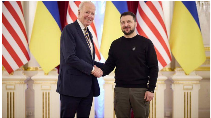
UN President Joe Biden visits in Kyiv on surprise visit

Ukraine is a country that declared sovereignty, closely located as bordering Russia. Russia first attacked Ukraine in 2022, then officially announced that the alliance with Russia was over and they would start the war. Ukraine is still searching for military forces and weapons by seeking other partnerships. The United States is one of the strong supporters both financially and politically. The additional support that Ukraine has received helped Ukrainians. Other fundraising activities also helped Ukraine by providing necessities essential for human beings' survival. Although the current situation in Ukraine is not ideal, they will also keep standing against Russia to protect their country.