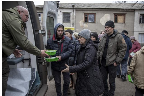
UN Providing Foods to Refugees

The Russia-Ukraine war forced millions of people to flee from their hometowns. Among millions of refugees, most of them need to stay with inferior facilities and hunger. Many citizens endured hardships after Russia destroyed the essential facilities. The United Nations is helping Ukrainians with food, water, shelter, and medical care regardless of age and gender. The UN is also holding a fundraising campaign to support further those impacted by the war. They deliver emergency aid and assistance to people as refugees seek safety and peace.